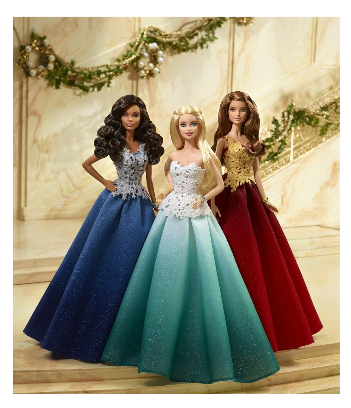
2016 Holiday Celebration Barbie

2016 — It's been a while since the designers have thrown us for a loop. This year, collectors and fans are given a huge and fabulous surprise. Dress colour choices! You can chose from three different dolls gowns that fades from powder blue to dark blue, white to turquoise or burgandy to red. The skirt has a gorgeous gradient that leads up to a bodice made of snowflakes. Her hair is tucked under itself and made to run down her back. This new edition perfectly represents the style of 2016 and is an amazing way to get ready for the holidays.