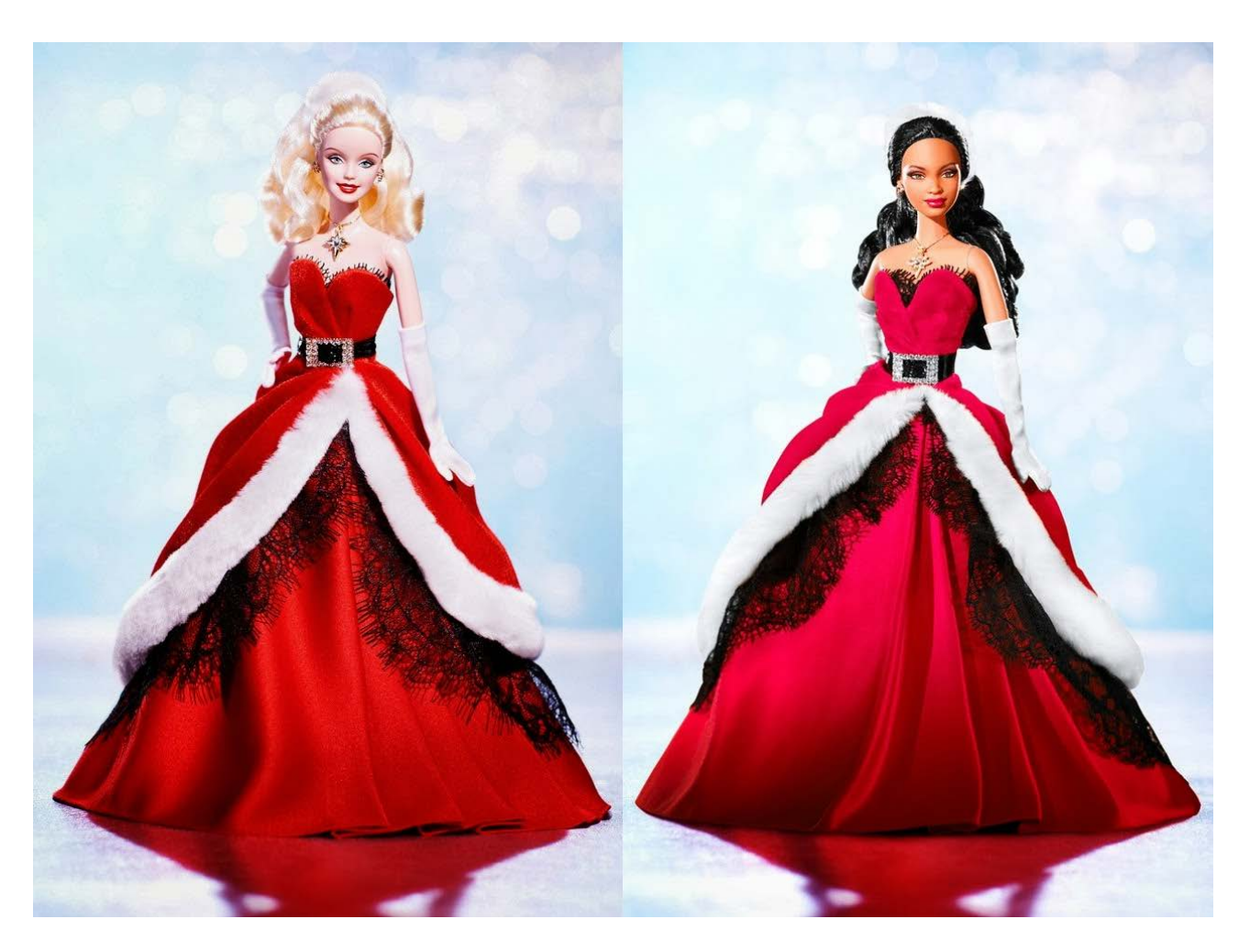
2007 Holiday Barbie

2007 – This stunning and strapless gown is a red velvet ensemble modeled after Santa himself. Her jacket flows over the bell-shaped bottom and features a festive white faux fur trim. In between the jacket and gown there is an additional layer of black lace for a luxurious accent. Her waist features a "santa-esque" belt and protruding from her corset is the same black lace from under the jacket to add even more flair. Her hair is pulled back through a white faux fur headband and her necklace has a thin chain with a large dangling snowflake. This is an amazing take on a Mrs. Claus or Santa-style that only an icon like Holiday Barbie could pull off.