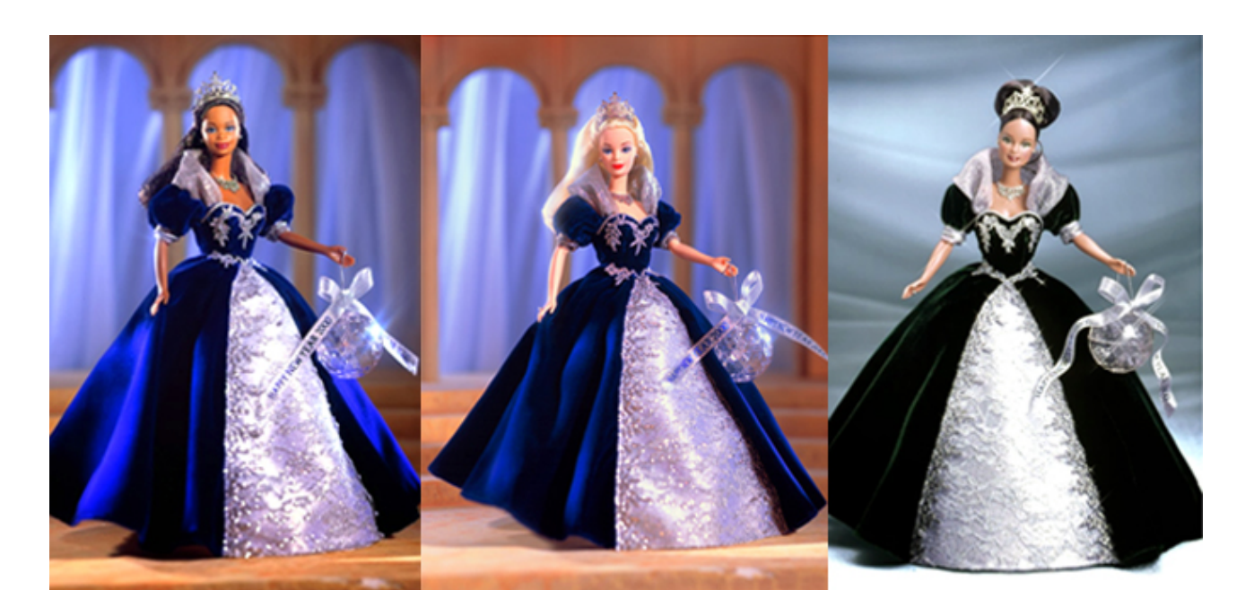
Millennium Princess Barbie 1999

1999 – Nicknamed "The Millennium Princess", this new edition doll was a breathtaking way to move into a new millennium. Available in all three versions (Caucasian, African American, and Brunette), her gown was a beautiful blue with puffy sleeves covering her upper arms. The front of the dress was a stunning silver which leads up to a pattern of festive accents around her chest and waist. Her neckline was covered by a large silver collar and she is holding an ornament that wishes you a happy new year on it's silver bow. The "Millennium Princess" Barbie's hair is held in place by a stunning crown fit for a princess in 1999 and a queen in 2000.