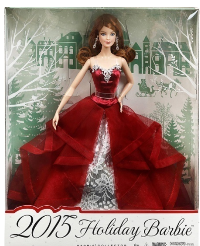
2015 Holiday Barbie

2015 – This year is absolute elegance. Holiday Barbie is wearing a silver accented red corset that flows into a long and ruffled red gown. The dress opens to reveal a shining and festive silver-and-white floral printed inset. Her long dangling silver earrings and perfectly styled hair help to keep your eyes moving around this doll while never running out of new details to discover. It is an absolutely breathtaking representation of Holiday Barbie.