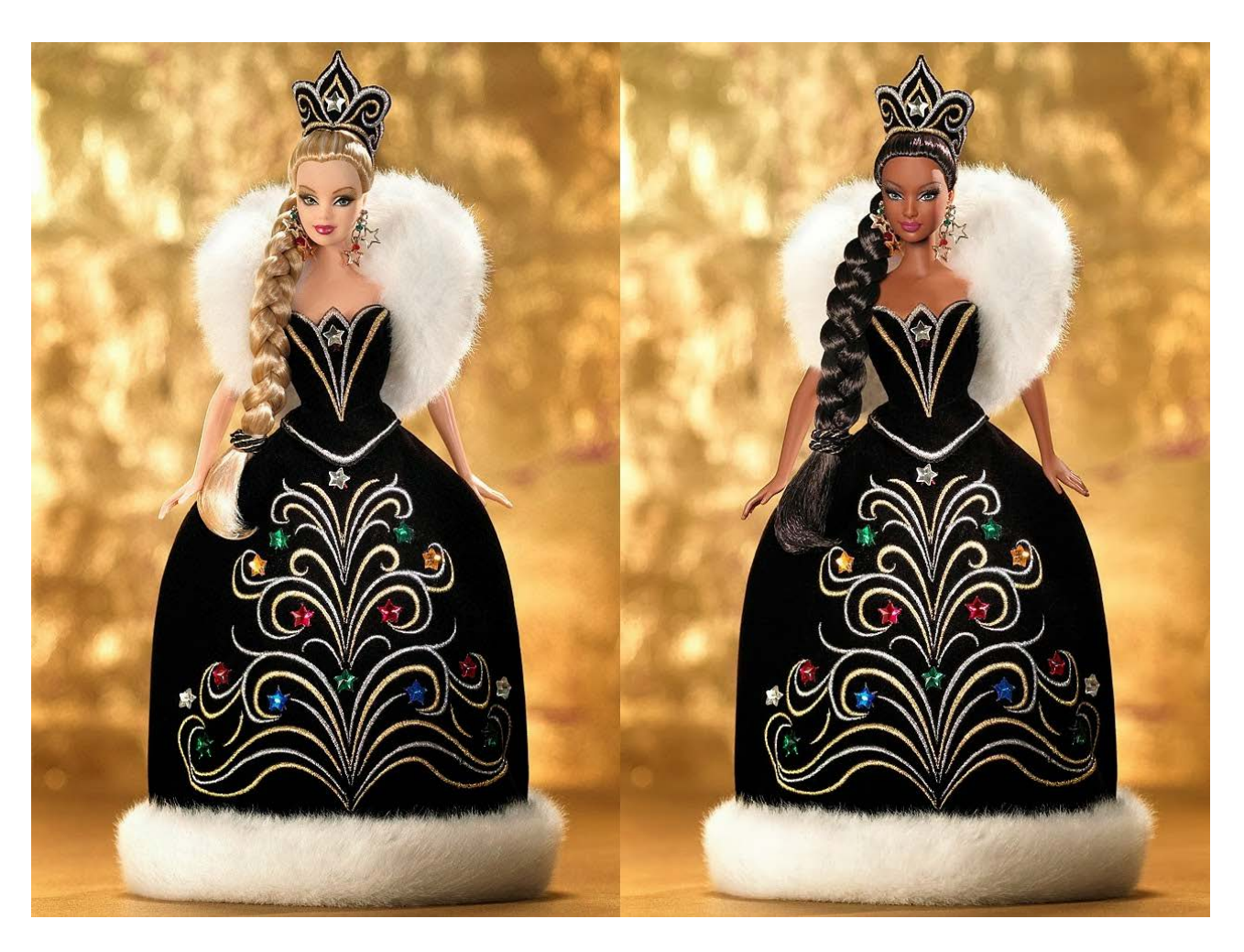
2006 Holiday Barbie

2006 – This year, Holiday Barbie is dressed in black. This bell shape gown has a faux fur trim on the bottom and collar. The dress is adorned with gold patterns and multi-colored jewels. Her hair is pulled into a tight braid and off to the side flowing from her crown. She accents her dress with dangling earrings made from golden stars and gemstones. The bodice features gold piping and a star at the peak of her chest instead of a necklace or choker.