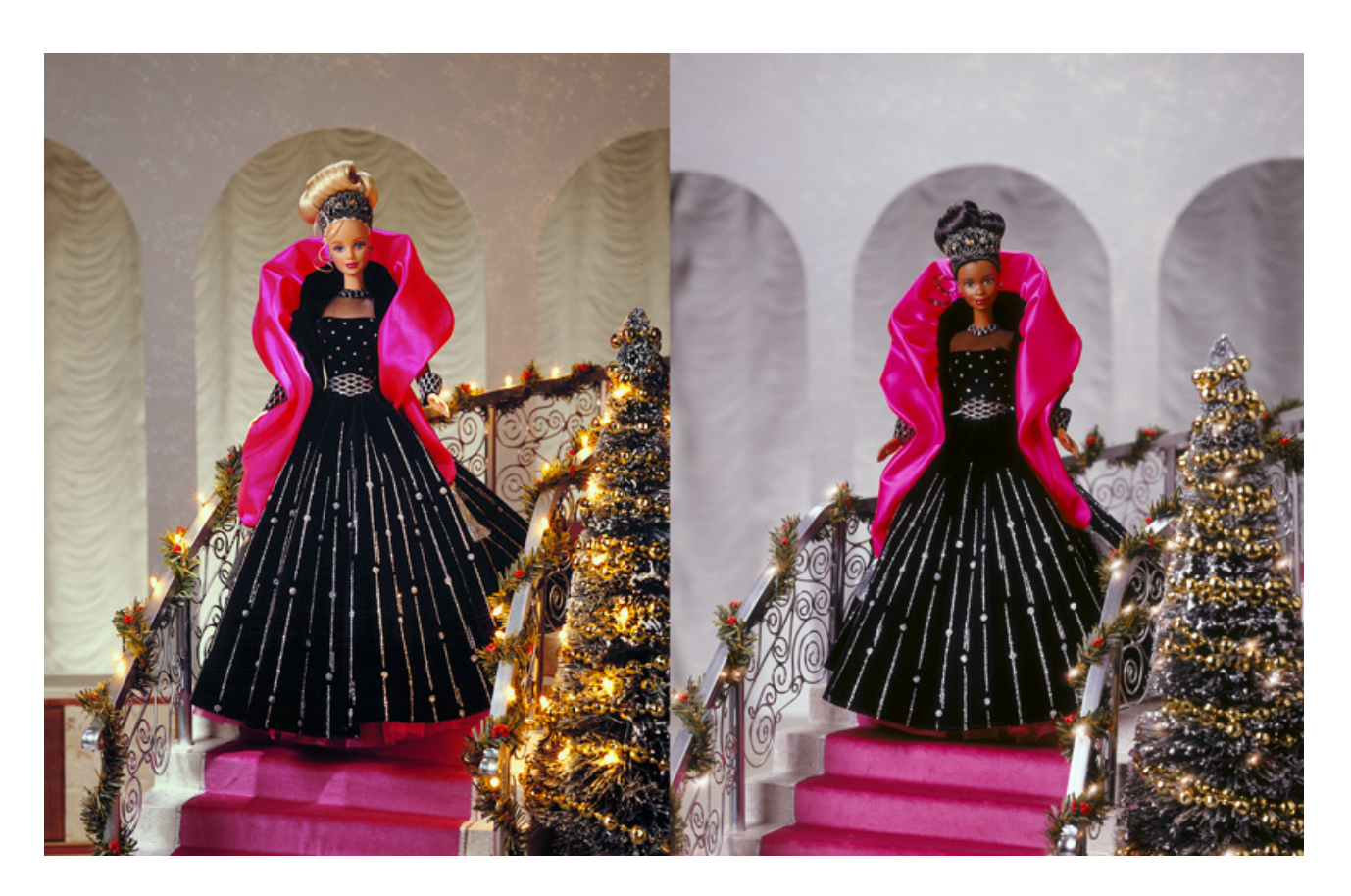
Happy Holiday 1998

1998 – This year Happy Holidays Barbie traded in her previous look for a more refined elegance. Central to that is the new "Mackie face sculpt" that was introduced on this doll. Instead of a curly, free-flowing style, her hair is held in an updo by a silver tiara. In a year in which black was especially hot for evening wear, Barbie is, as always, completely on trend. This was the first of the Holiday Barbies to wear black, and the gown is a stunner. It feature a long, bell-shaped black gown has long silver accents creating movement and flow. Her waist is wrapped in a luxurious band of silver design and her top has silver beads to shine and sparkle. If the drama and flair of this gown isn't enough, the designers gave her a huge, hot pink shawl to go over her shoulders and frame her face and hair before dropping gracefully to her waist. Her necklace was replaced with a choker that is part of her gown. Sophistication, glamour and elegance are the only ways to define the style of this year's edition.