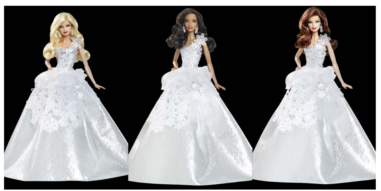
2013 Holiday Barbie

2013 – Holiday Barbie turns 25 this year. The perfect way to celebrate her silver anniversary is with a silver ensemble. Her large bell gown is accented at the top with white snowflakes that flow from her skirt up through her bodice and to her left shoulder. Her gorgeous dangling silver earrings are the perfect accessory to add that extra wow factor without going overboard. This is the perfect silver gown to match her silver anniversary.