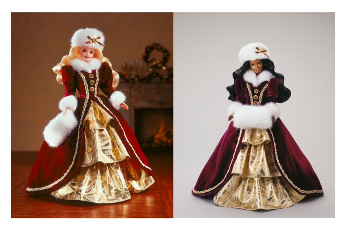
Happy Holiday 1996

1996 – When you think of the holidays, what's more delightful than a Currier and Ives print? That was the inspiration for this year's look with the designers returning to the Victorian era. This was also the first doll to show Holiday Barbie dressed for the outdoors. She's ready for a sleigh ride or chestnuts on an open fire in a plush velvet, burgundy jacket with white faux fur at the collar and wrists. The opening of the coat is lined with golden stripes and three large red and golden buttons complete the centre to hold the coat closed. Her gown is a tiered golden masterpiece and her hair is held neatly in a white fur cap accented by a matching burgundy and golden ribbon bow. When you've always done fashion forward, sometimes taking the past and making it modern can be a new way to shock and amaze. It paid off with this edition.