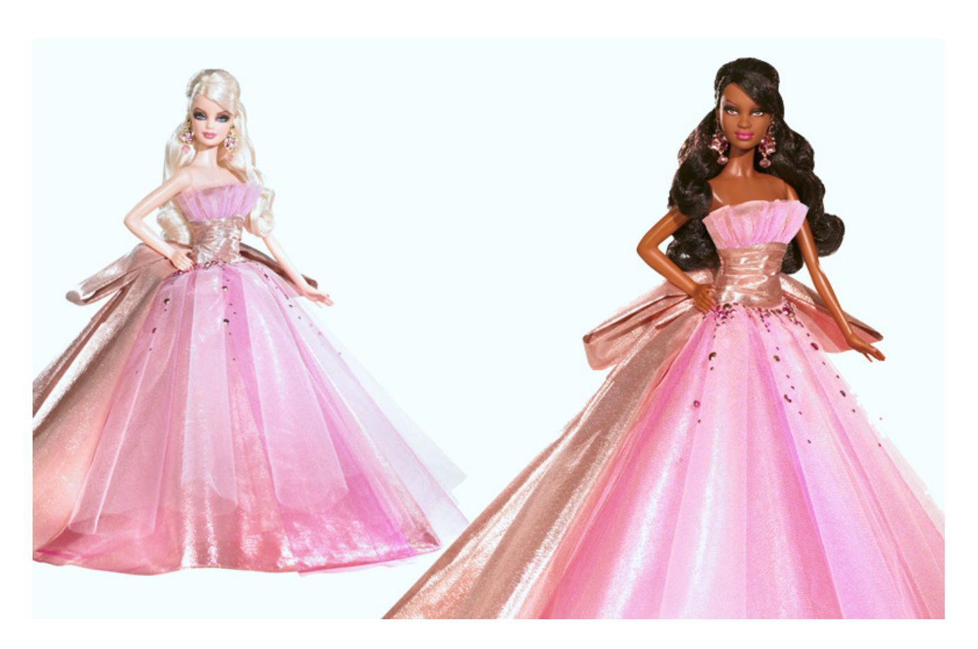
2009 Holiday Barbie

2009 – This golden lace-wrapped bodice extends into a brilliant pink tulle ball gown. The gold lace turns into an oversized golden bow on her back, and rhinestones lead from the base of her bodice to the top of the skirt. Her golden chandelier earrings are oversized and feature pink gems to match the colours of her dress.