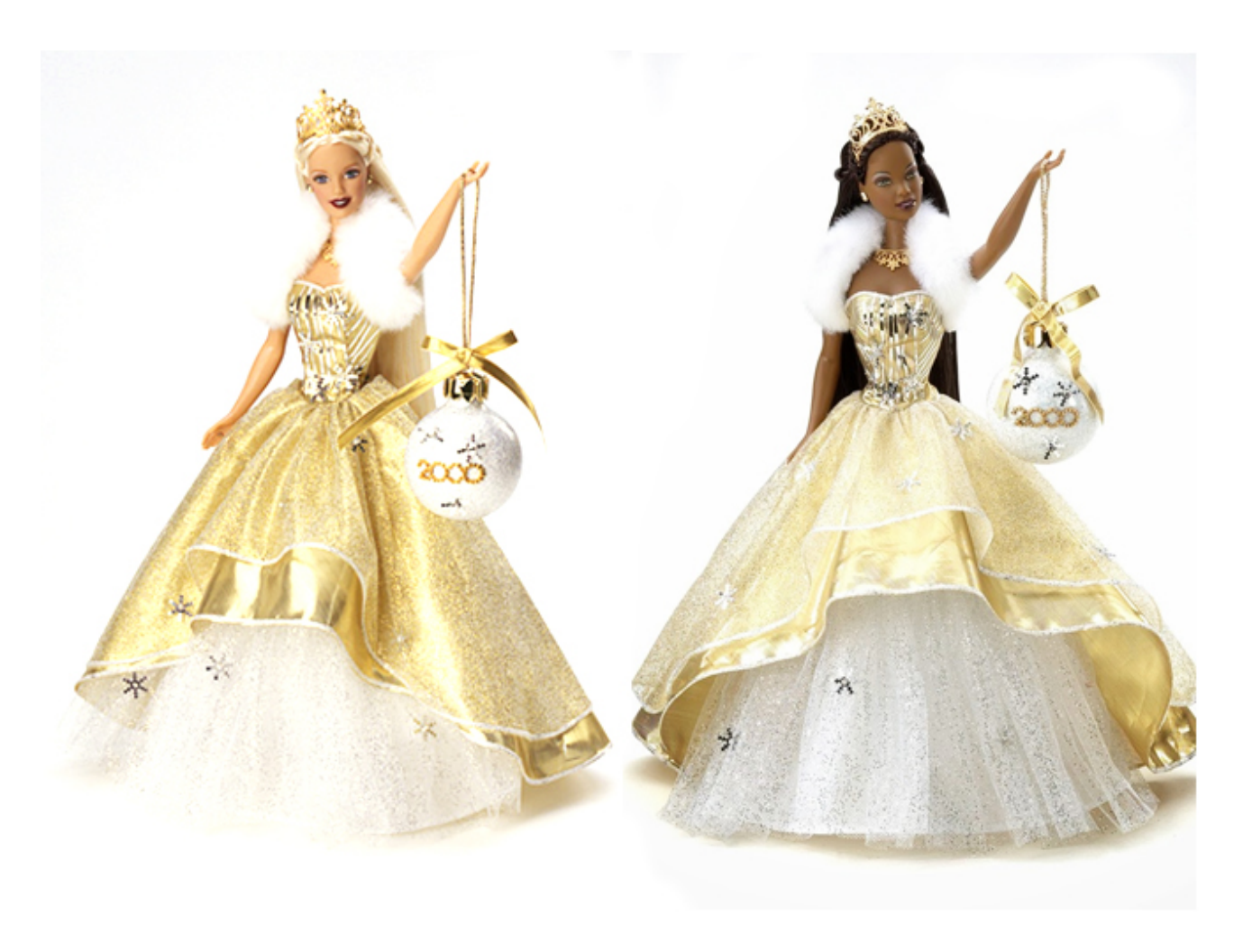
Holiday Celebration Barbie – 2000

2000 – After the new nickname in 1999, Happy Holidays Barbie got another reinvention. This year she's called "Celebration Barbie". Holding a large and sparkling, white ornament that says 2000, this festive edition is a "golden" celebration of all things new and festive. Her gold gown features silver snow flakes off of the front that float above the exposed white tulle that creates the bell. Her chest is covered by a patterned golden corset and she has a white faux fur shawl to keep her neck and shoulders warm. Her hair is pulled back under a crown and her makeup is purely formal. Celebration Barbie is the definition of class and elegance.