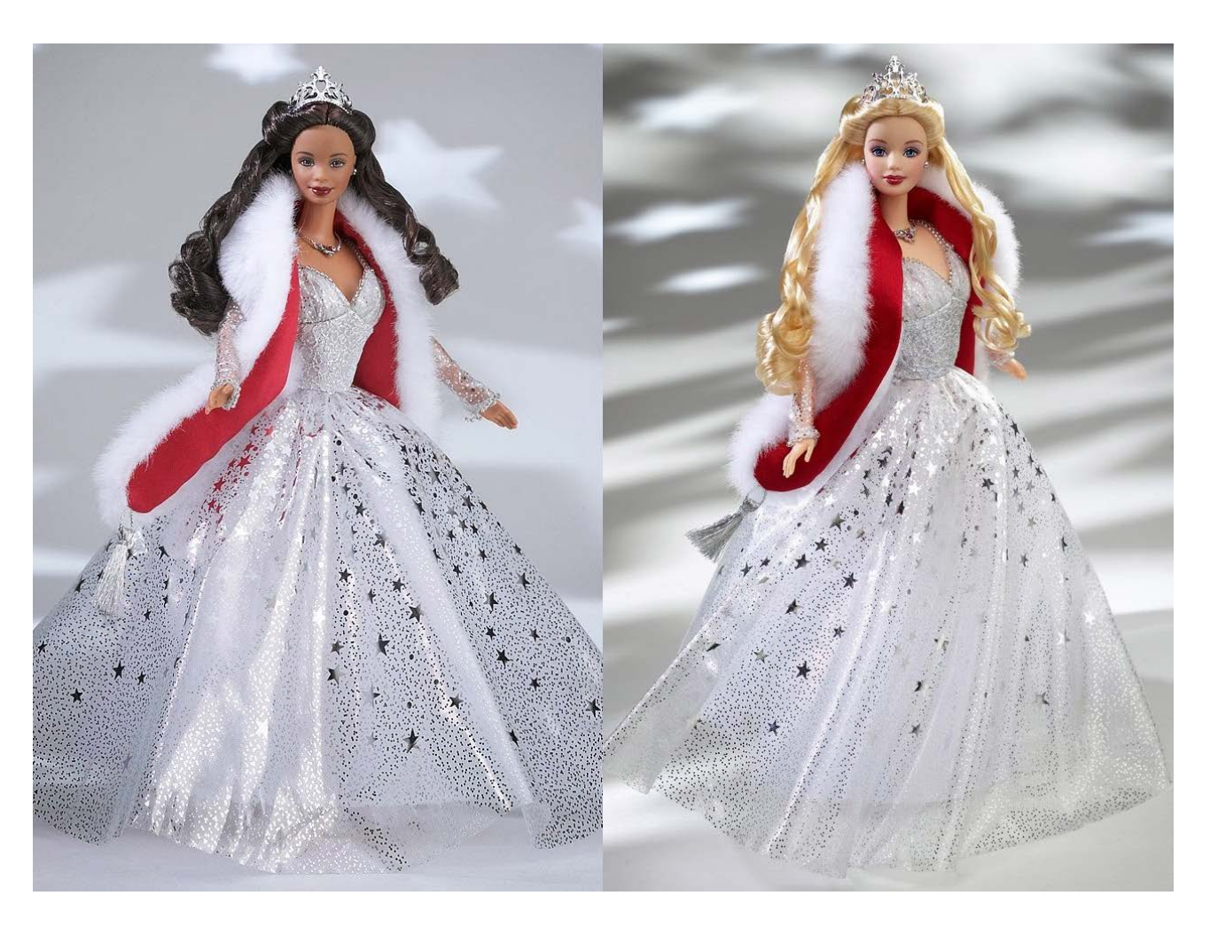
Celebration Barbie - 2001

2001 – This year's Holiday Celebration Barbie is a stunning example of empowerment. She stands stoic in her red and white gown. Her hair flows from her queen's tiara around her arms and over her large white, fur-lined shawl. Her white dress has a stunning pattern on the chest that flows into a star studded white ball gown. The 2001 edition also brings back a jeweled necklace that perfectly pulls the entire piece together.