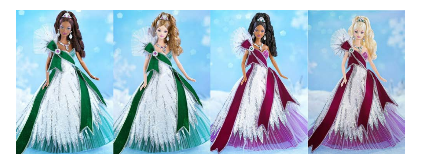
2005 Holiday Barbie

2005 – This year, our stunning beauty got a new gown from renowned designer Bob Mackie. Her asymmetrical dress has a huge tulle accent the extends from the ribbon on her right shoulder down through her gown. The ribbon wraps her like a gift, featuring a split on the left side of her gown that drapes along the right. Her white gown is accented at the bottom with silver lined frosted icicle shaped cuts and finishes at the base with layers of pink tulle in different shades. Her earrings are huge drops and perfectly match the oversized, jeweled necklace and her green and white tiara. This dress is truly a high fashion holiday sensation!