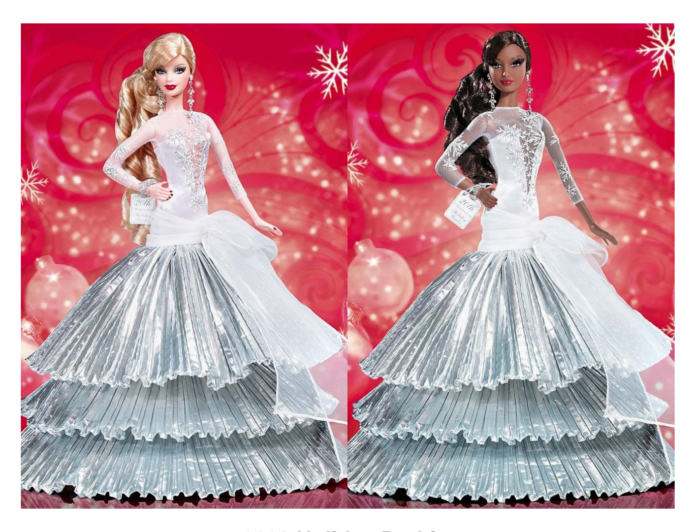
2008 Holiday Barbie

2008 – Coming right from the silver screen, this doll fetes the 20th anniversary of Holiday Barbie. She wears a glorious triple-tiered silver gown that matches the one from her version of "A Christmas Carol". This dress screams haute couture with its oversized silvery white bow, sheer fabric sleeves, and stunning silver snowflake adorned white bodice. Her long curls are pulled off to the side and her stance is powerful yet elegant. Her long dangling, jeweled silver earrings perfectly match the bracelet on her right wrist. The makeup is perfection with her bright red lips, black eyeliner, and a smoky eye.