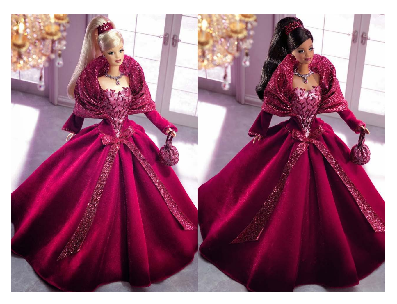
Celebration Barbie - 2002

2002 – Holiday Celebration Barbie has another glamorous look this year. Her gown is a stunning deep-red with a thin sparkling bow that flows from her gown into a large shawl. The bodice features a matching red print that resembles branches and leaves over a pink base that matches her clutch. Her necklace is short and her hair is pulled up and through a band of dark red jewels that match the red of her shawl.