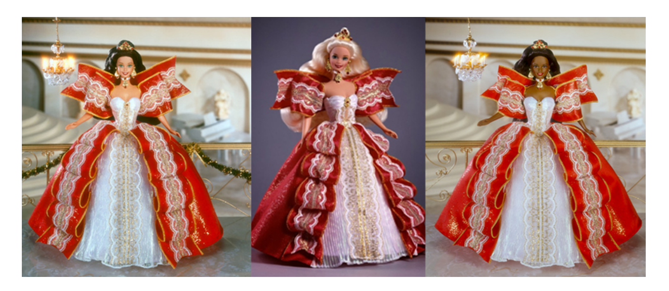
Happy Holiday 1997

1997 – This year Barbie gave us not only looked like an angel with her ribbon wings and accented gown, but we got another surprise. Why should blonds have all the fun? Not only did we have the regular Caucasian and African American versions, but they found a friend names Teresa who happens to be a brunette. The opened red gown features golden adorned patterns that match the white fabric with golden patterns on the main gown. All three women have matching tiaras fit for an angel and the overall piece has a silhouette that could easily make them a perfect option for the top of a Christmas tree. Collectors now have three special editions they can add in this holiday release.