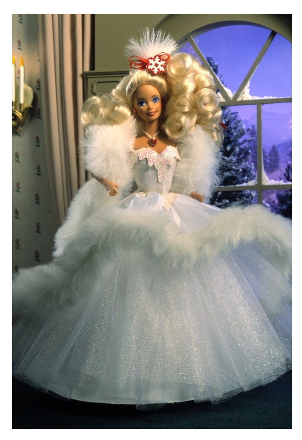
Happy Holiday 1989

1989 – With a huge white ball gown complete with faux fur trim and matching cape, this stunning style made a dramatic statement on store shelves. Much like her previous style, Barbie also had the bountiful blond hair and large tulle skirt. The bow was replaced with a more understated snowflake-shaped hair accessory, and she wore a stunning red-jeweled necklace. The designers hit another year out of the park by creating a show-stopping follow-up to an overnight sensation.