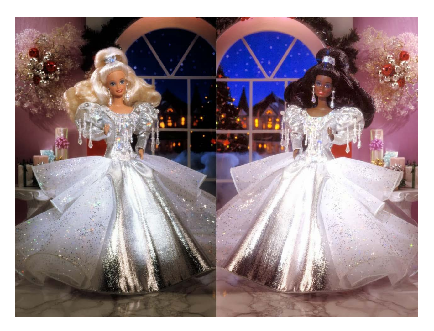
Happy Holiday 1992

1992 – This year, Mattel returned to one design for both the Caucasian and African-American dolls—and what a gown it was. With hair similarly styled as the previous year, the new version had huge chandelier earrings accenting her face which also match the dangling gems from her sleeves and the glimmering silver tulle gown. The dress featured a slinky, chic bodice with a large tulle accenting hoop skirt and puffy sleeves that gave it a modern feel and sense that Barbie was floating. The detail work on her gown now contained what looked like gemstones and her hair piece was a band fit for royalty. Mattel did it again with this new feel and fashion.