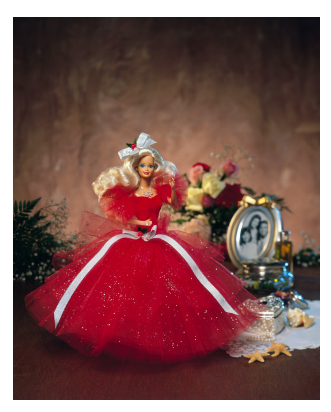
Happy Holiday 1988 - 1st ed.

1988 – This is the year we were first graced with this trendsetting classic. It all started when Mattel decided to shake up the world of dolls and collectible toys by releasing what would quickly become a holiday icon. The first Holiday Barbie, then called Happy Holidays Barbie, became an instant sensation with incredible demand. Her big hair and starlet smile are reminiscent for adults who were children in the 1960s. And her accessories, such as her tulle ball gown and oversized bow, stood out as a fashion-forward dream. Setting the bar high with the first release, it was time to plan the next iconic edition for 1989.