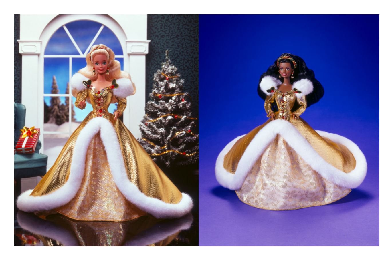
Happy Holiday 1994

1994 – This year gave Barbie some dramatic flair to her normal style. Instead of a small headband or large bow, her hair was nestled in a tiara of red-and-green holly berries. Her giant golden bell-shaped dress is adorned with large faux fur pipes separating the Victorian-patterned front from the glittery golden sides of her dress, designed to reveal a stunningly detailed underskirt. The full-length sleeves are accessorized with a bright sprig of mistletoe at the top, just above the tastefully plunging neckline. Red jewel-like accents on the fitted bodice beautifully offset the expansive skirts.