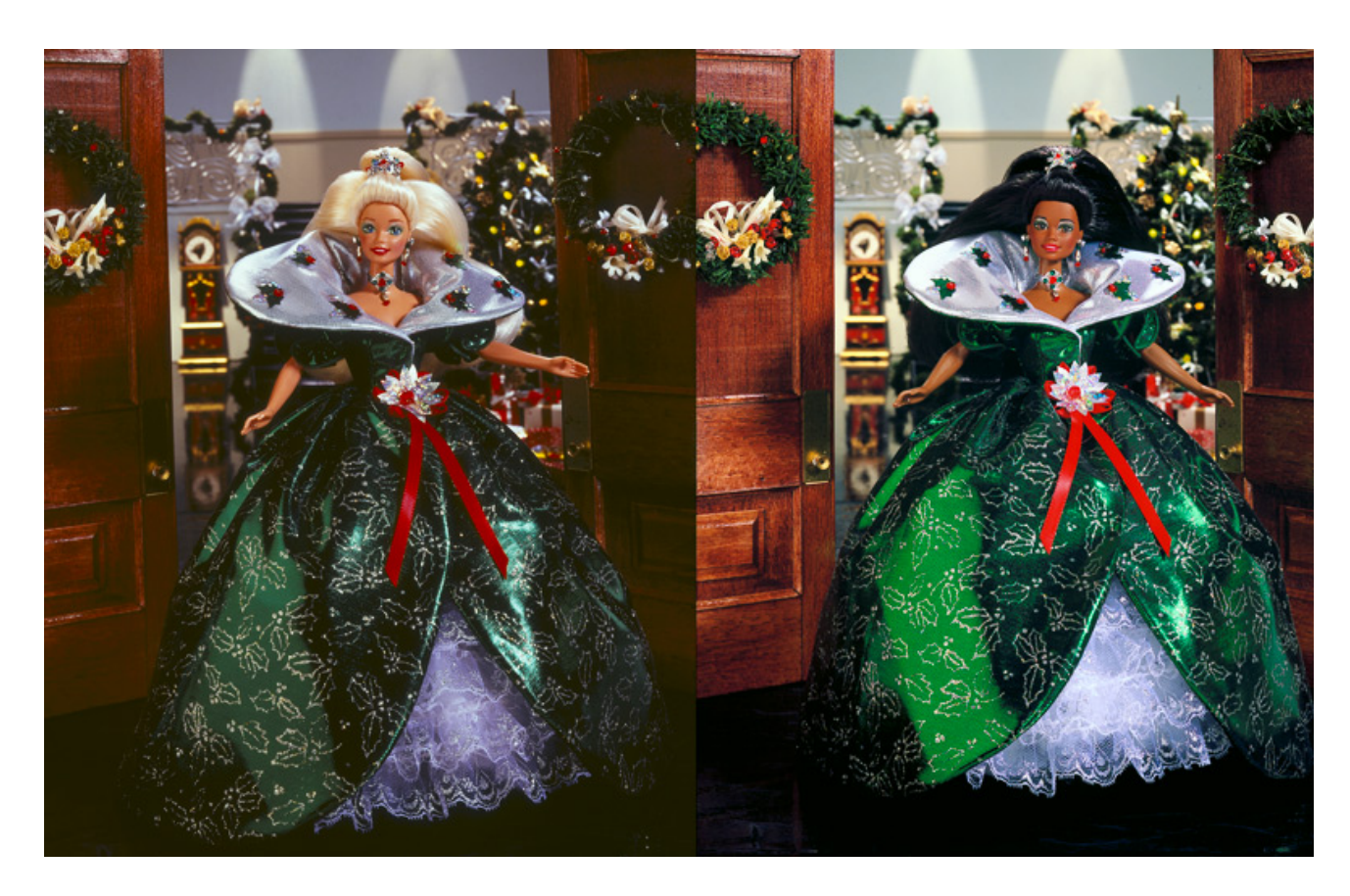
Happy Holiday 1995

1995 – The designers have created something over the top for seven years. You'd think they'd be out of ideas, but not for Barbie. The 1995 holiday gown was inspired by the classic glamour of the late Victorian period in a gorgeous, jewel-toned green with silver holly leaves decorating the full skirt. A delicate lace underskirt is the perfect, lighter than air counterpoint to the rich fabric. The bodice is topped with a graceful petal-like neckline adorned with mistletoe that beautifully complements the festive floral jeweled red and green choker necklace, which also has silver accents running down her neck. A stunning hairstyle and stunning silver and green eye shadow complete this show-stopping look.