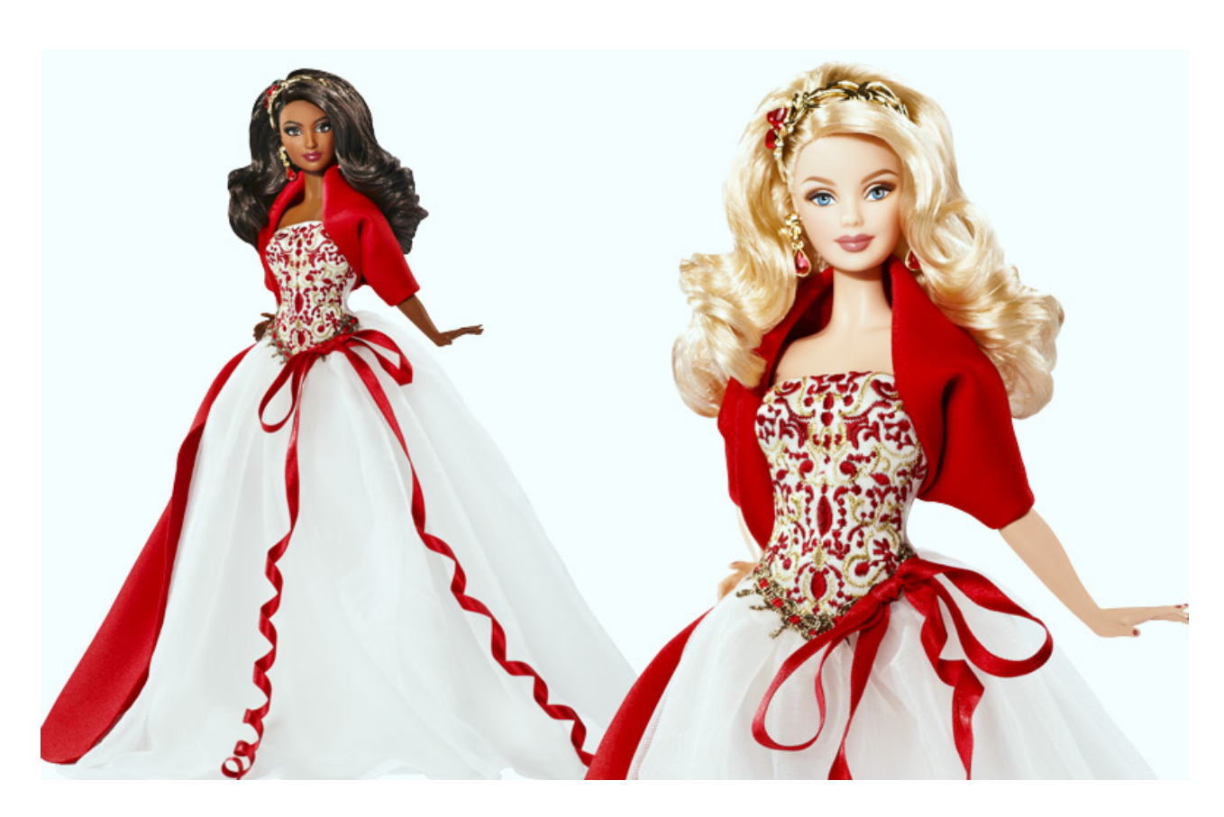
2010 Holiday Barbie

2010 – Her bodice has a stunning Victorian-inspired gold and red print fit for a queen. Her shrug shawl is red and flows down to the back of her dress. Her hair is pulled through a golden headband and her large white tulle ball gown is accented with a thin red bow made from curled ribbon. The bodice and skirt are also connected via red and gold rhinestones that match her gold-and-red dangling earrings.