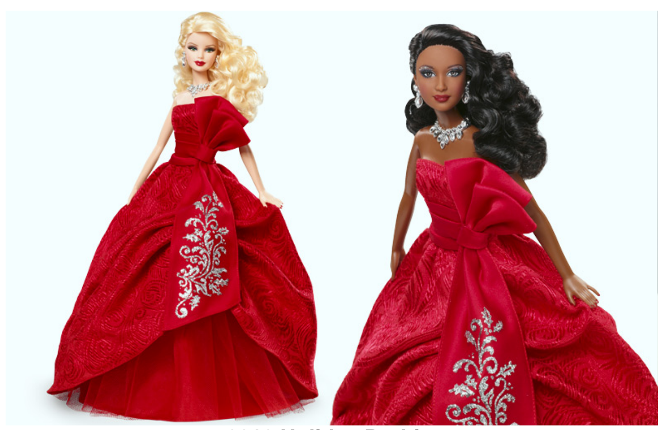
2012 Holiday Barbie

2012 – Back in red, Holiday Barbie looks like a rose. Her red satin gown has a floral texture to it and is accented by a huge bow that wraps around her bodice. The bow, which comes down the tulle bell skirt, is adorned with a sparkling silver pattern that perfectly matches her luxurious silver necklace and earrings. With red nails, red lipstick, and smoky eyes to match, she is a red holiday masterpiece that will make any collector's heart melt. The blonde and brunette have the face sculpt Mackie, while the African American sculpt Godess.