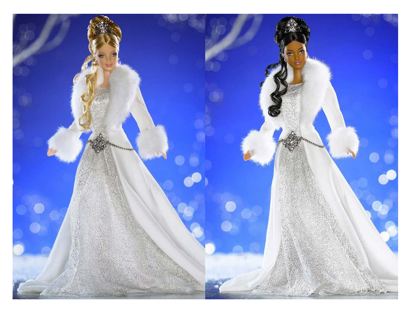
Winter Fantasy Barbie – 2003

2003 – This year collectors were in for another fabulous surprise. Although the box says "Holiday Visions", she quickly adopted the name "Winter Fantasy". In an all-white long coat, her sleeves and collar feature a fabulous faux fur. The jacket is opened revealing a sparkling silver gown. Her hair is back in an up do held together by a jeweled tiara. Instead of a neck, she's wearing a large jeweled accent piece with a chain that crosses her waist.