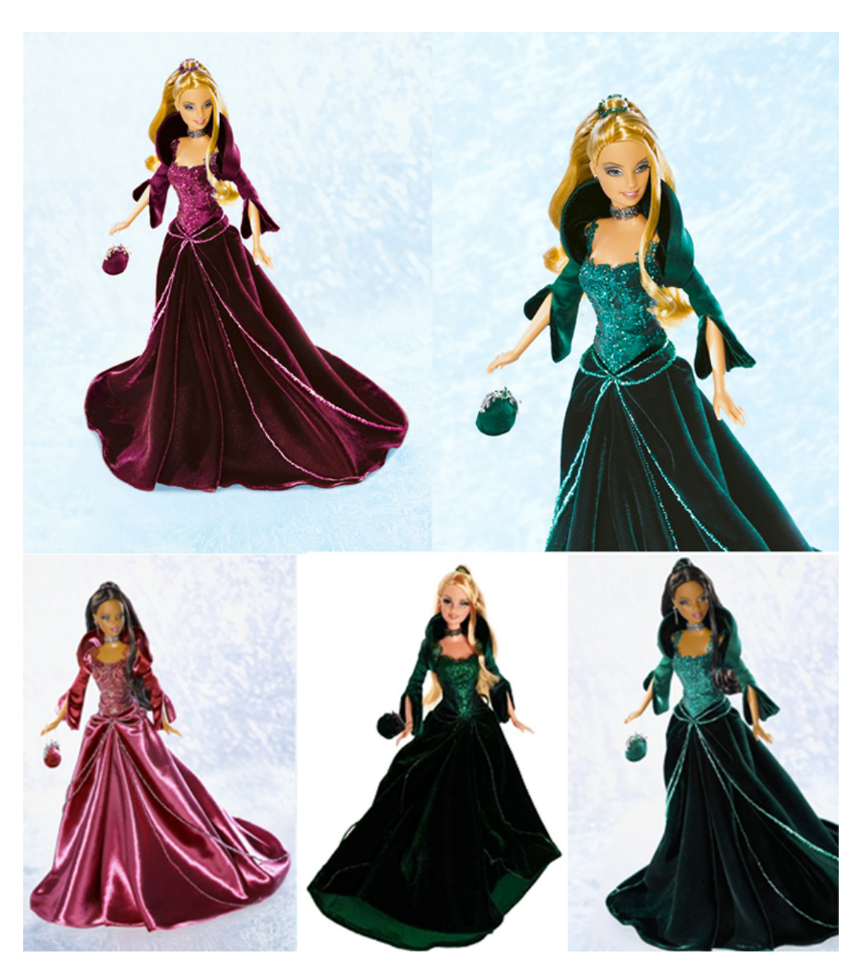
2004 Holiday Barbie

2004 – If the show-stopping white number wasn't enough in 2003, this year you get color options (but only if you found the Sears limited-edition doll in red). The standard collectible is set in a gorgeous green bodice that sparkles. Her sleeves are ¾ length and flow up to her collar. The gown is long and features gorgeous silver lines. Her neck shows off a choker with a large green gemstone in the center and her hair is pulled back through a band of green beads. Instead of an updo or being pulled back, her hair matches the earthmother feel of the gown and flows along the back of her gown with a large-curled strand in front.