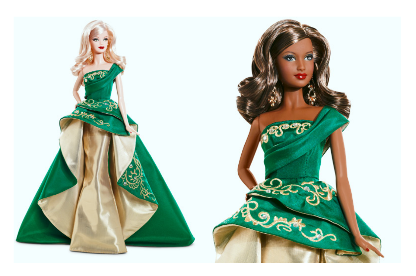
2011 Holiday Barbie