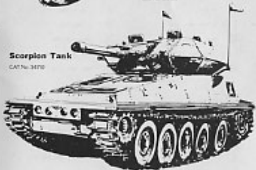
Scorpion Tank CAT No 3870