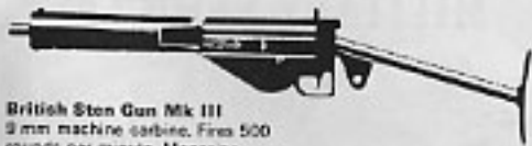
British Sten Gun Mk III 9 mm machine carbine. Fires 500 rounds per minute. Magazine holds 32 rounds.