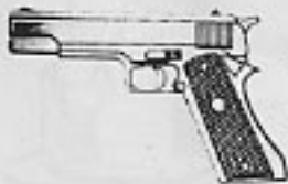
American Colt .45 pistol Automatic .45 calibre pistol. All steel Government model with 7 shot magazine.