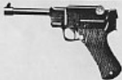
German Luger 9 mm automatic pistol. Accurate up to 75 yds. Box magazine holds 8 rounds.