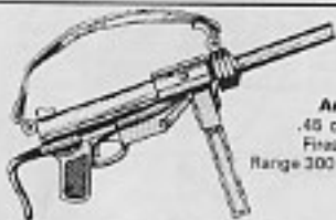
American Thomson M3 .45 calibre sub-machine gun. Fires 650 rounds per minute. Range 300 yds. 30 round magazine.