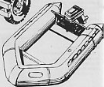
Assault Craft CAT No 3830