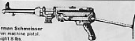
German Schmeisser 9 mm machine pistol. Weight 8 lbs. Folding stock. Length 33 in.