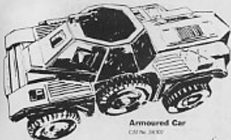
Armoured Car CAT No 3830