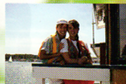
With conventional metering